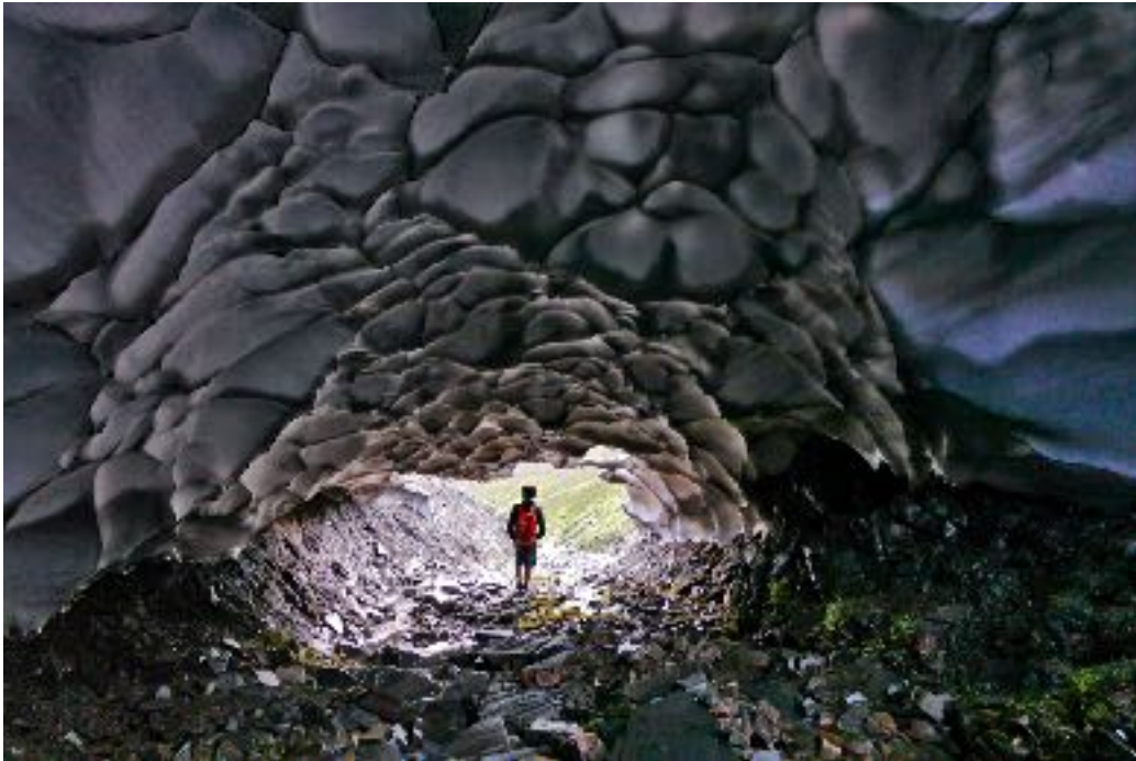
Summer Snow Tunnel