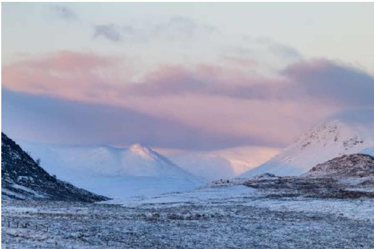
Into the Monhadliath from Balgowan

Behind the house, the seldom visited Monhadliath form a large remote barrier stretching all the way to the Slochd where a chink in the armour allows the A9 to continue north. The hills are often described as featureless, however they comprise a huge seldom visited wilderness with obscure corries & distant views where constantly changing light reveals hidden features.