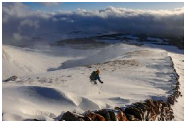
The Moy Wall of Creag Meagaidh