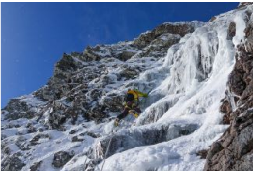
Tackling a new ice climb in The Moy Coire

Arguably the mountain jewel in the crown is Creag Meagaidh & its satellite summits. One of the largest areas of high ground outside the Cairngorms, the mountain is a complex series of ridges, summits, corries & cliffs which I've walked, skied & climbed numerous routes since a first visit in 1984.