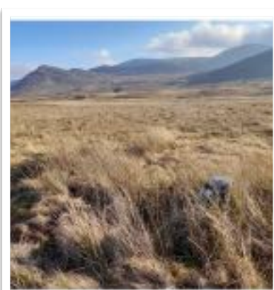
Clach Cathelus standing stone. Creag C behind, left