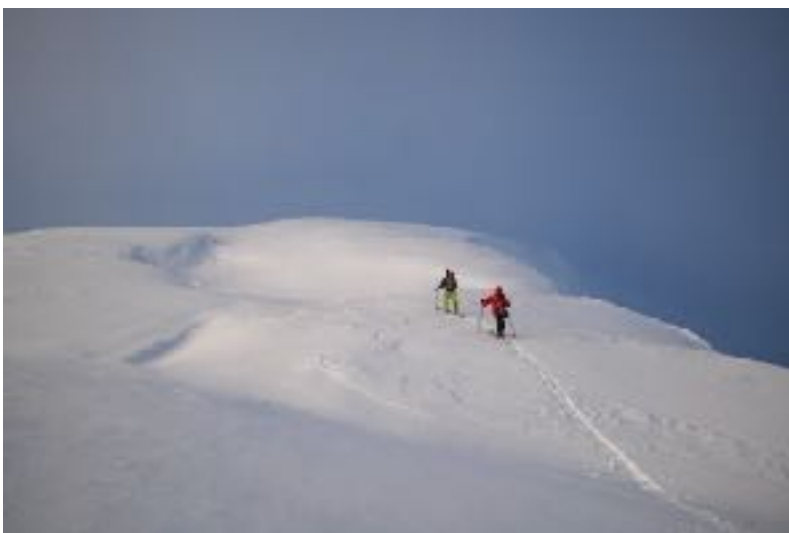
Heading up Carn Dubh above Garvamore

In recent years ski mountaineering has become a favourite activity and with sufficient snow the hills in the area provide excellent skiing terrain