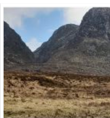
The Defile (dearc) size of cave