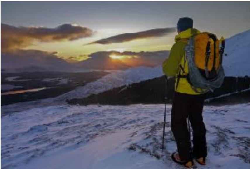
Heading back to Moy after a day climbing

Photography has been a lifelong interest since I was given a Russian made SLR camera for my 16 th birthday. In the 45 years since, a long line of cameras have seen action throughout Scotland & beyond with winter landscape & outdoor sports featuring in most of my images.