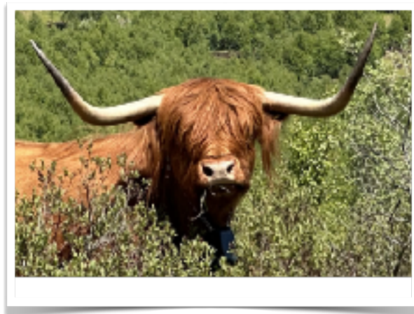
One of our resident highland cows enjoying some bog myrtle

management done on the reserve. Beyond keeping the deer numbers at a low to help regenerate our montane woodlands, we're ecstatic to see this work extended to community members in helping them gain new skills and insight, as well as bringing home some venison at the end of it all.