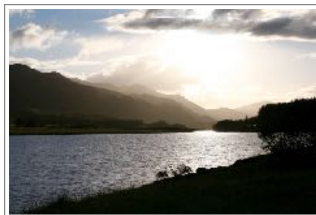
The Spey reservoir is a vitally important wetland for some of Scotland's rarest waders