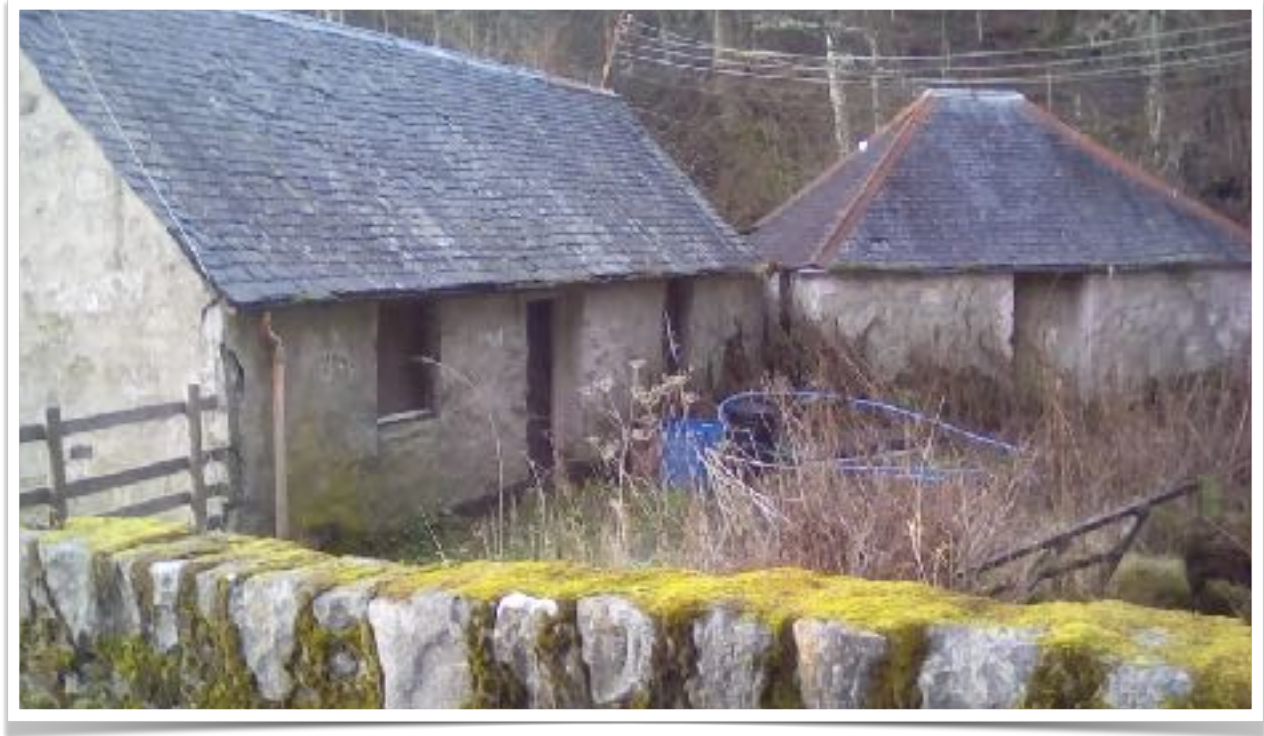
Bothy Bar 2022, now disused