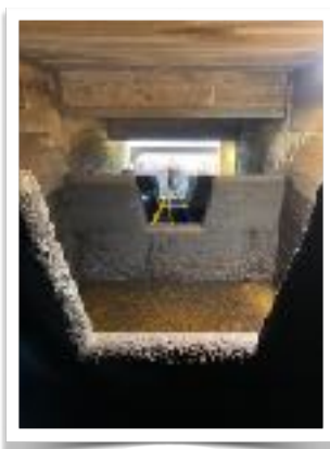
View of the fish passage in the Spey Dam, prior to improvements in lighting to allow for improved salmon passage