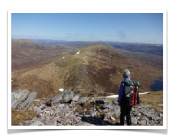
Towards Laggan from Geal Charn