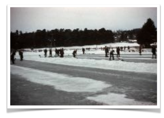
Grantown Skating Pond