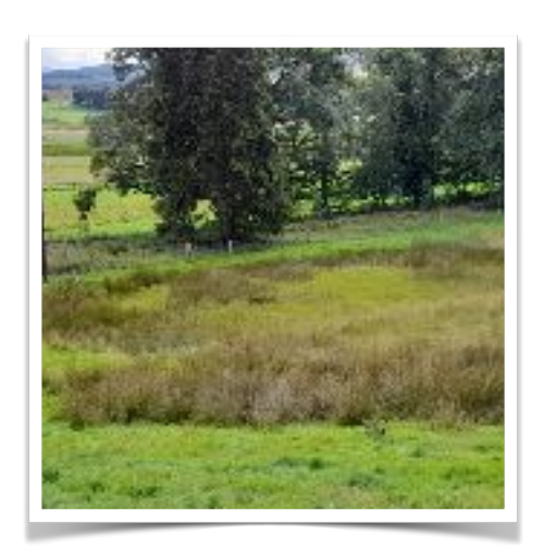
Cluny Pond below the Castle

In 1873 several games were played at Gorstean on the old river bed (now tree covered below the Community Forest car park), and in Feb 1874 the newly instituted Cluny Castle Club played their opening game in a new pond near the castle. "Cluny asked for a temporary pause and called upon all present to drink, in overwhelming bumpers, to success to the club."