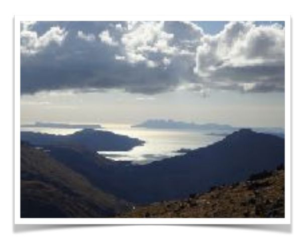
Rhum and Eigg from Luinne Bheinn