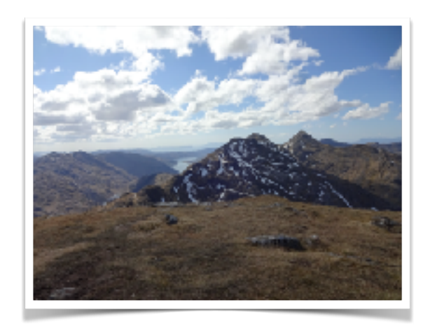
Looking back at Sgurr na Ciche