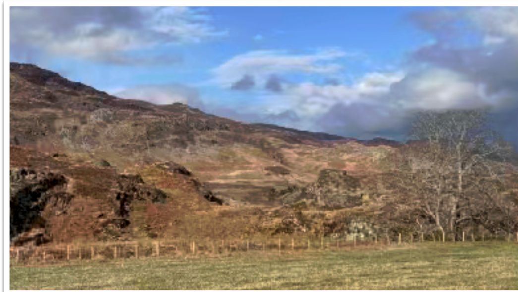
within the Laggan Parish

Answer to last issue's photo:-Crubenmore