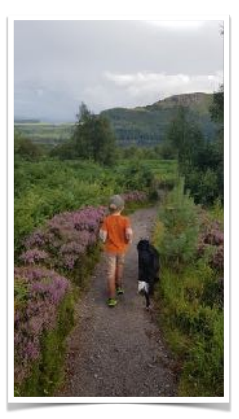
The course is ideal for children and their furry friends.

Map Extract from the short course. The triangle indicates the start. At the centre of each circle is a checkpoint on the ground - you choose your route between them but it is best /driest / quickest to follow the existing paths. A full legend is provided on the maps.