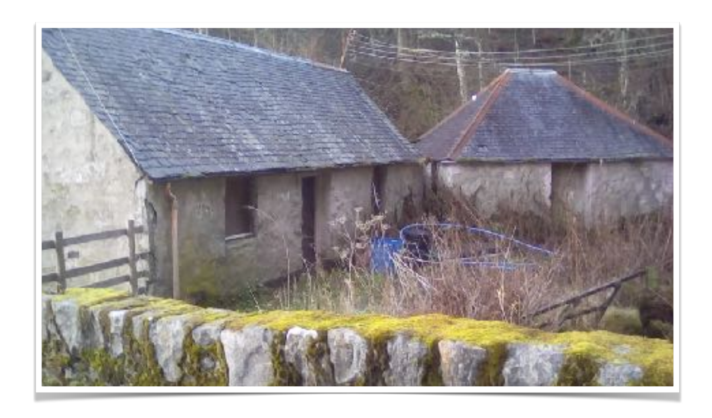
Bothy Bar 2022, now disused